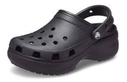
Examples of Non-permitted PE Footwear ×